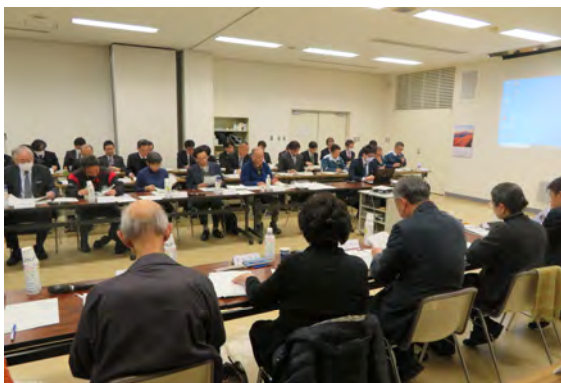
200th regular meeting