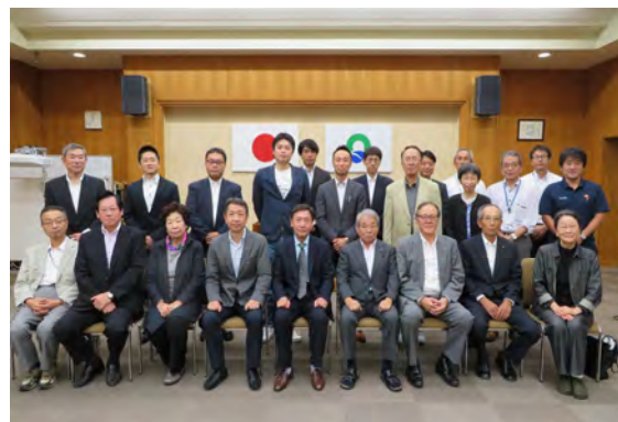
Fukui Prefecture observation (Ohi Town, Fukui Prefecture)