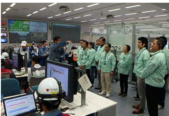
Visit to the Kashiwazaki-Kariwa Nuclear Power Station to observe training, etc.