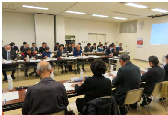
167th regular meeting