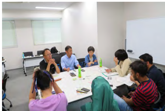
Dialogue with Nagaoka University of Technology students