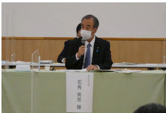
233rd regular meeting (Information sharing)