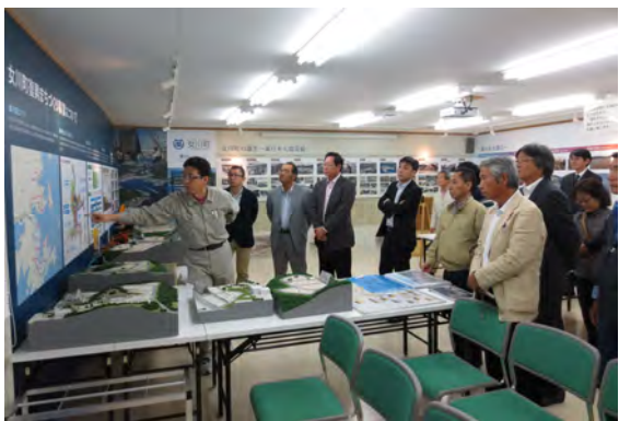
Visit to the Onagawa Nuclear Power Station