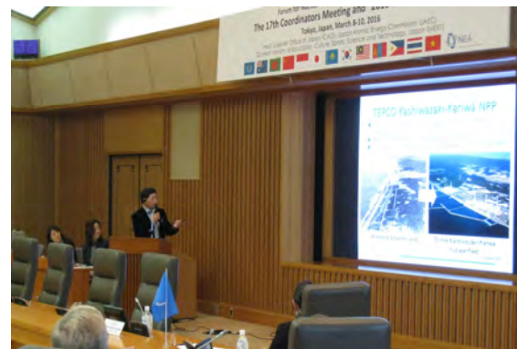
Forum for Nuclear Cooperation in Asia