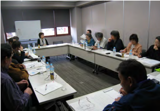
Opinion exchange meeting