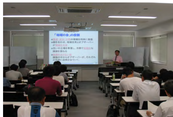
Town hall meeting with Nagaoka University of Technology