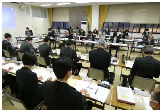
215th regular meeting