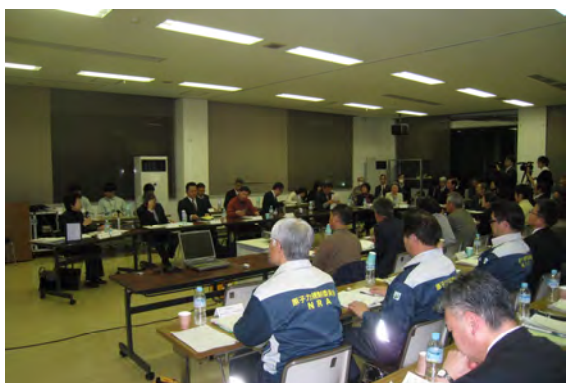
142nd regular meeting