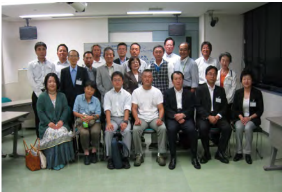
Observational study in Fukushima Prefecture