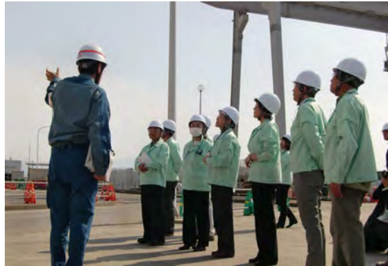
Visit to the Kashiwazaki-Kariwa Nuclear Power Station