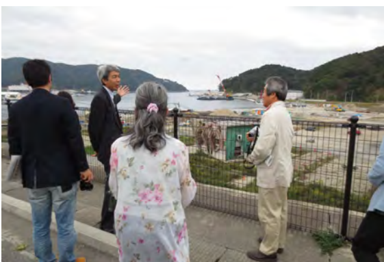
Visit to the Onagawa Nuclear Power Station