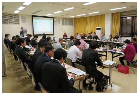
184th regular meeting