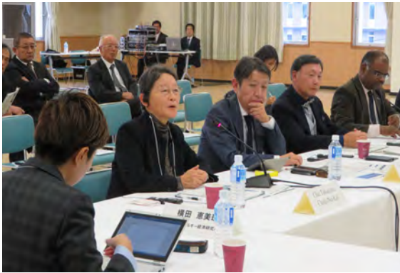
Opinion exchange with opinion leaders from Japan and abroad on nuclear energy