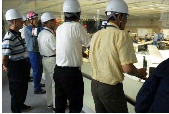
Visit to the Kashiwazaki-Kariwa Nuclear Power Station