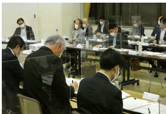
228th regular meeting