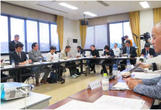
191st regular meeting