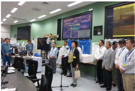
Observational study in Fukushima Prefecture