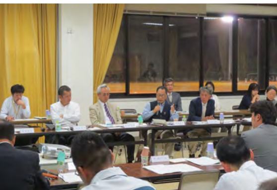
148th regular meeting