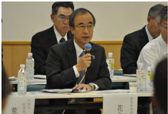
197th regular meeting (Information sharing)