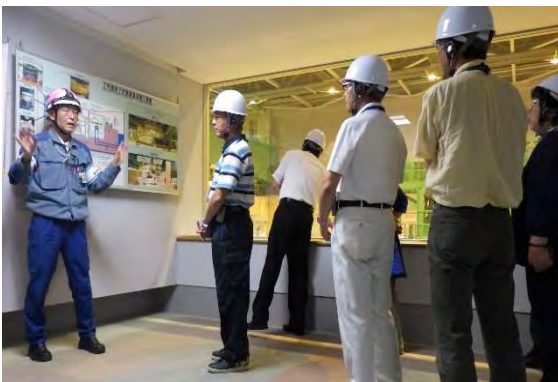
Visit to the Kashiwazaki-Kariwa Nuclear Power Station