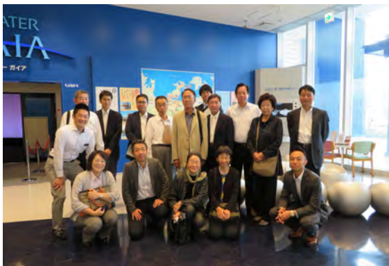
Fukui Prefecture observation (Ohi Nuclear Power Station)