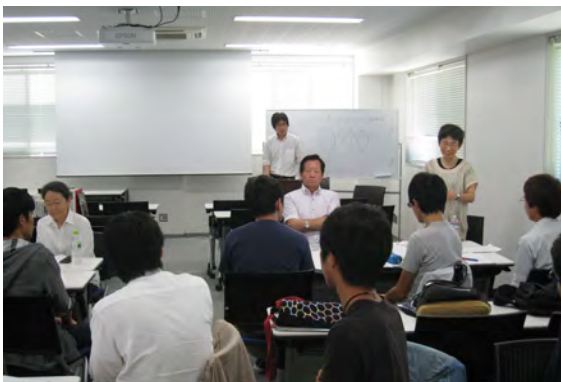
Dialogue with Nagaoka University of Technology students