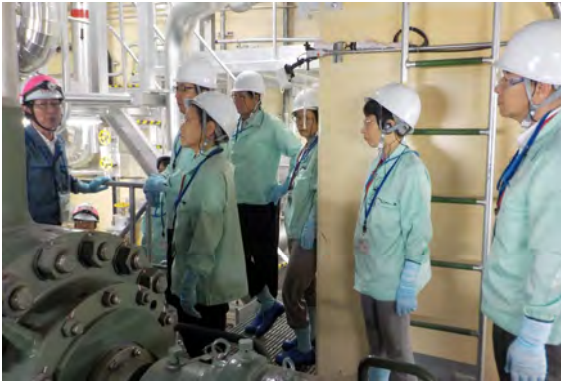
Visit to the Kashiwazaki-Kariwa Nuclear Power Station