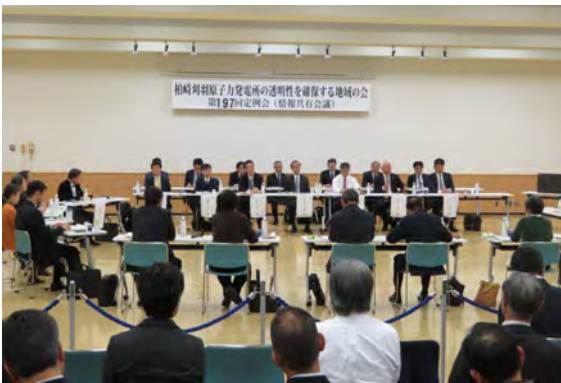
197th regular meeting (Information sharing)