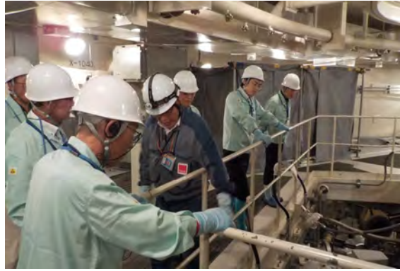
Visit to the Kashiwazaki-Kariwa Nuclear Power Station