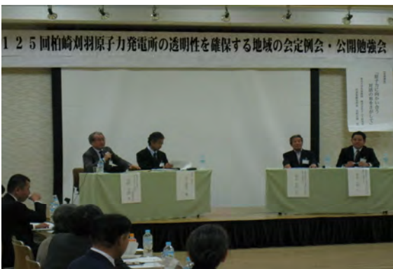
125th regular meeting "Open Study Session"