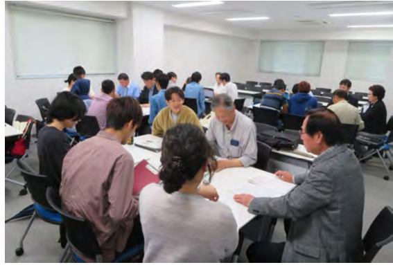
Dialogue with Nagaoka University of Technology students