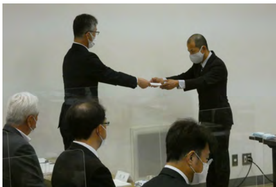
215th regular meeting