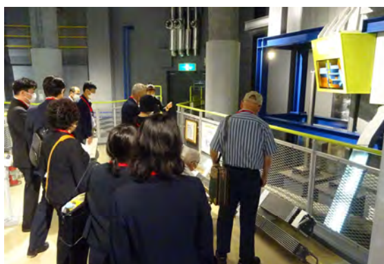
Aomori Prefecture study tour (Rokkasho Village)