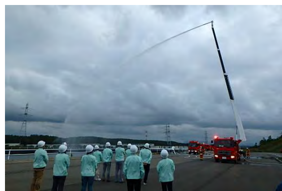
Visit to the Kashiwazaki-Kariwa Nuclear Power Station to observe training, etc.