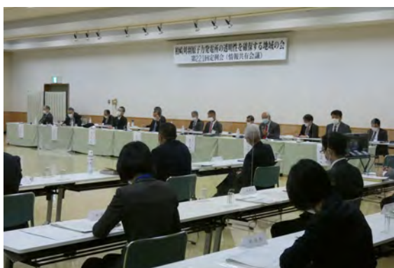
221st regular meeting (Information sharing)