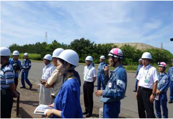
Visit to the Kashiwazaki-Kariwa Nuclear Power Station