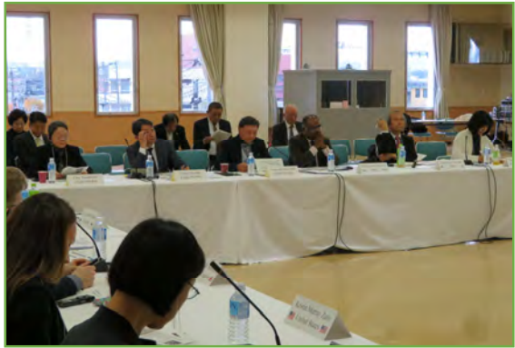
Opinion exchange with opinion leaders from Japan and abroad on nuclear energy