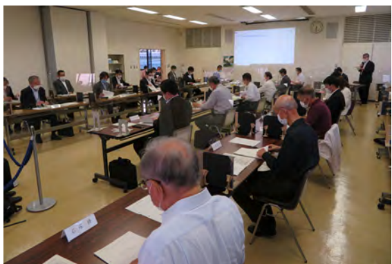
204th regular meeting