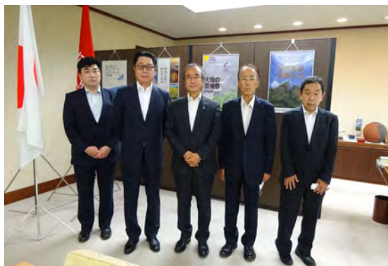
Visit with the Governor of Niigata Prefecture